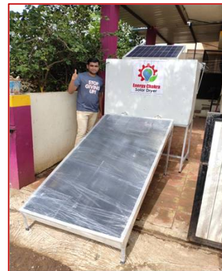
Cabinet Solar Dryers