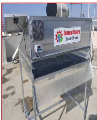
Domestic Solar Dryer

Domestic Solar Dryer, Cabinet Solar Dryers, Tunnel (Dome) Solar Dryer