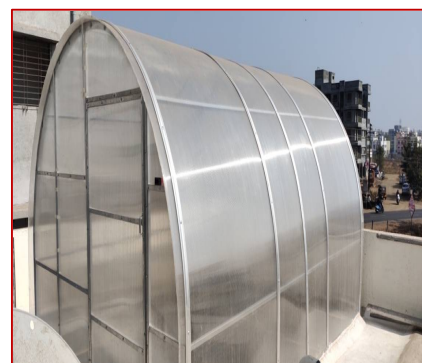
Tunnel (Dome) Solar Dryer