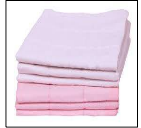
Baby Wraps and Towel