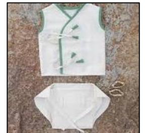
Cotton Daily Wears