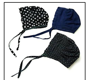
Caps for New Born